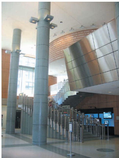
Interior of Science, Industry & Business branch of NY Public Library

It is rewarding for the Construction Industry Council and the large number of people who contributed to the development of DQI that the tool we started work on in